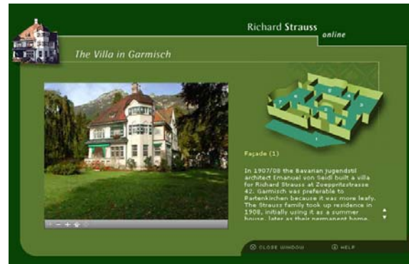
Figure 4. Small-scale VE system - the Richard Strauss House.