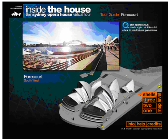
Figure 1. Large-scale VE System - the Sydney Opera House.

Furthermore, Figures 1 and 2 show example screenshots a large- versus small-scale VE system.